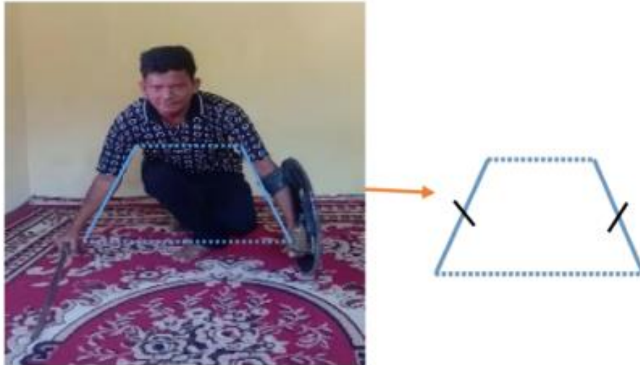
Figure 3. Ethnomathematical Findings in The Pasombahan Movement with a Respectful Gesture Approaching the Prostration Movement

The mathematical concept that can be expressed in the position of the prostration Pasombahan is not only an isosceles trapezoid shape. In this position, a straight line can be drawn from the head to the back of the informant and a line from the front of the head to the floor to form a triangle. The position of the right sword that touches the floor can form a triangle by pulling a straight line between the two grips.