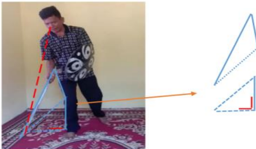
Figure 4. Findings of Ethnomathematics in the Gayuong Movement

In Figure 4 the Gayuong movement there are ethnomathematical findings in the position of the sword and foot that form an angle and if given a guideline between the tip of the sword and the footstool it will produce a triangular flat shape. In the Gayuong movement, there are ethnomathematical findings, where the position of the legs is bent and forms an angle > 90^\circ (blunt). In the position of the hand also forms an angle of < 90^\circ (taper). From the eye of the Silat fighter that leads to the tip of the sword, there are ethnomathematical findings, namely the concept of a line.