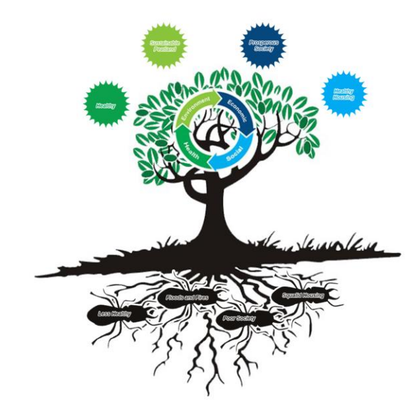
Figure 2. Hope Tree for Environmental Health Literacy

failure of environmental health efforts is summed up in these four areas.